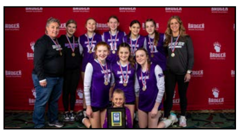
G14 BADGER 1ST PLACE: