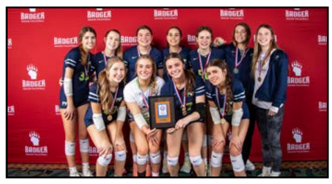
G16 BADGER 1ST PLACE: