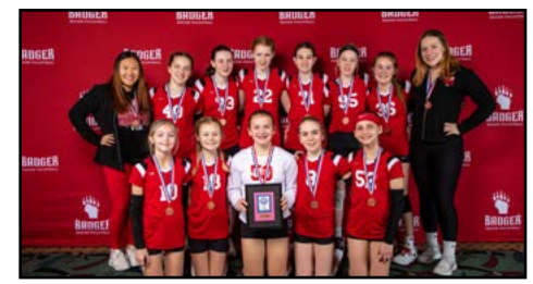
G12 CLUB 3RD PLACE: