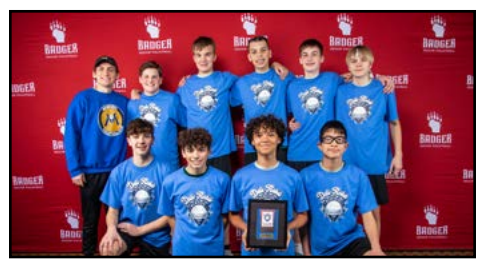
BOYS 13/14 RED 1ST PLACE: