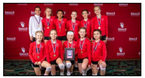
G11 CLUB 1ST PLACE: