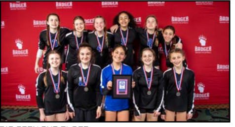
G12 OPEN 2ND PLACE: