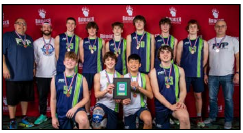
BOYS 165 3RD PLACE: