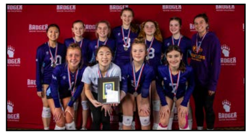
G13 OPEN 2ND PLACE: