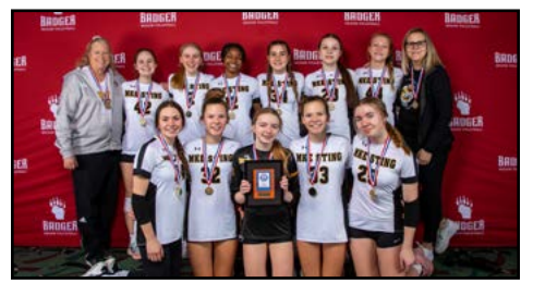
G15 CLUB 1ST PLACE: