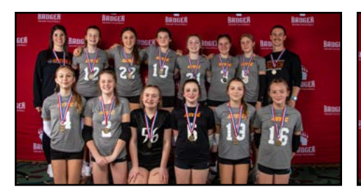
G13 WISCONSIN 1ST PLACE: