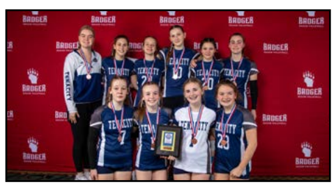
G14 WISCONSIN 3RD PLACE: