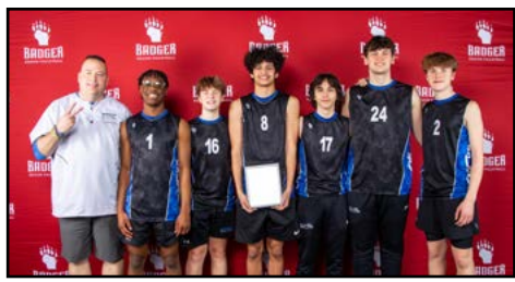
BOYS 17 WHITE 1ST PLACE: