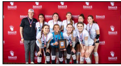
G16 BADGER 3RD PLACE: