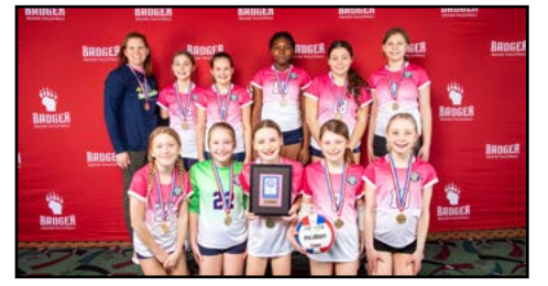
G12 CLUB 1ST PLACE: