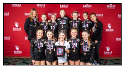
G12 OPEN 1ST PLACE: