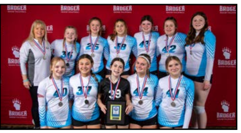
G14 BADGER 2ND PLACE: