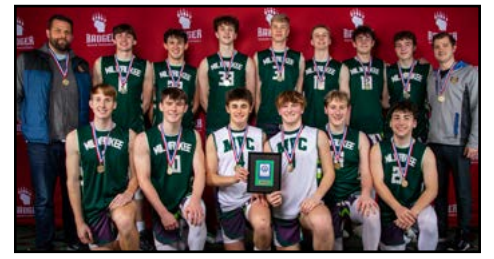
BOYS 185 1ST PLACE: