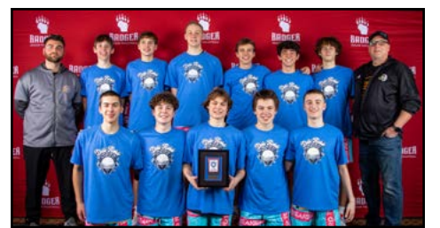
BOYS 17 RED 1ST PLACE: