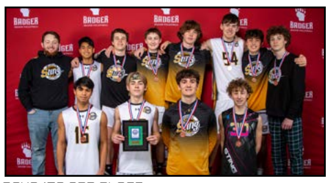
BOYS 155 3RD PLACE: