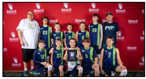
BOYS 12/13 WHITE 1ST PLACE