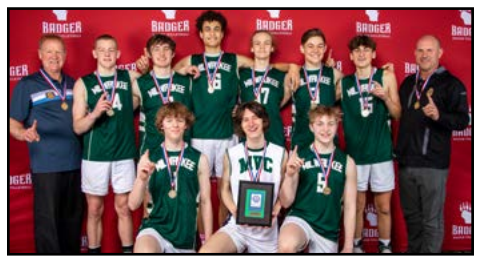
BOYS 155 1ST PLACE: