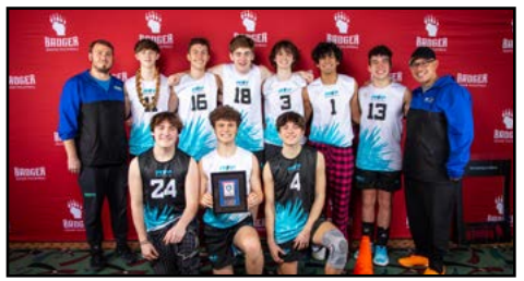
BOYS 17 RED 1ST PLACE: