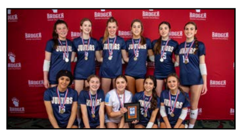
G15 OPEN 1ST PLACE: