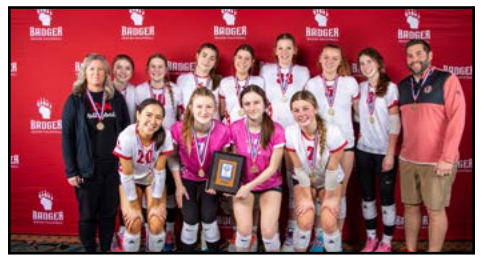
G16 CLUB 1ST PLACE: