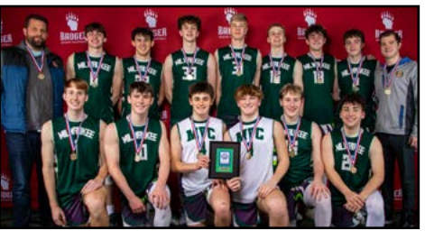
BOYS 18- RED 2ND PLACE: MVC 18-GREEK