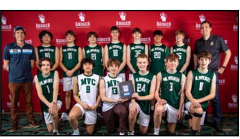
BOYS 15 RED 2ND PLACE: