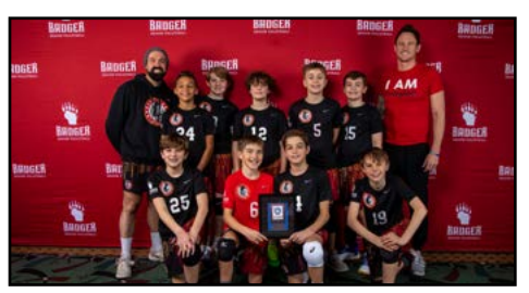
BOYS 12/13 WHITE 3RD PLACE