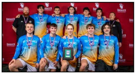
BOYS 185 2ND PLACE: