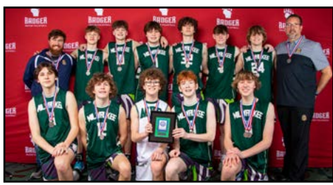
BOYS 155 2ND PLACE: