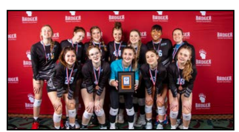
G16 WISCONSIN 3RD PLACE: