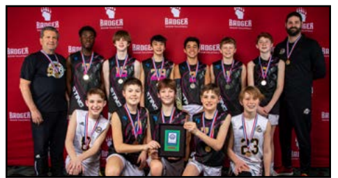
BOYS 13S 1ST PLACE