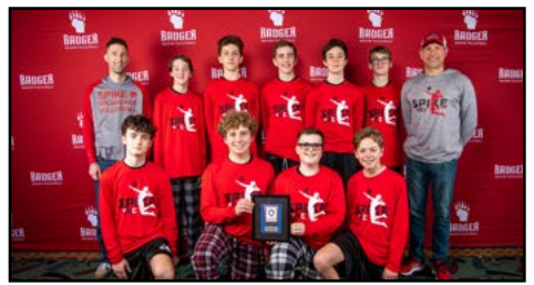
BOYS 13/14 RED 3RD PLACE: