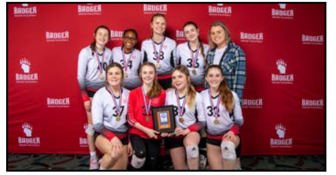
G15 WISCONSIN 1ST PLACE: