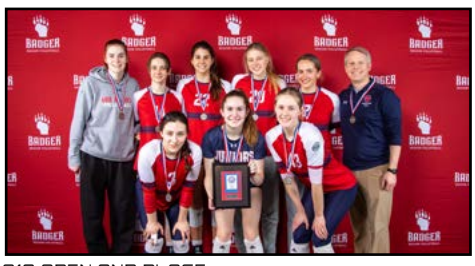
G18 OPEN 2ND PLACE: