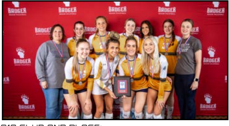
G18 CLUB 2ND PLACE: