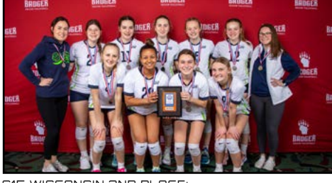
G15 WISCONSIN 2ND PLACE: