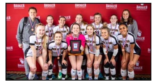
G17 OPEN 3RD PLACE: