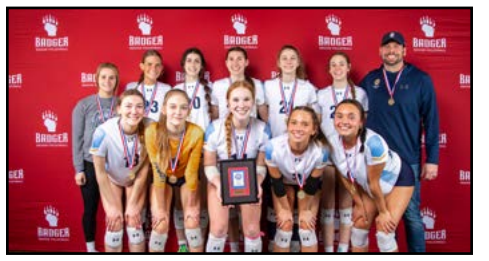
G18 OPEN 1ST PLACE: