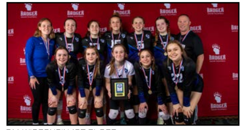
G14 WISCONSIN 1ST PLACE: