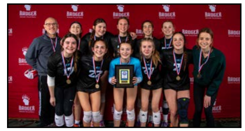
G14 OPEN 1ST PLACE: