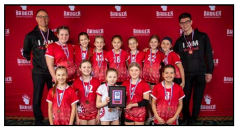
G11 CLUB 3RD PLACE: