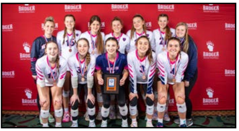
G16 OPEN 3RD PLACE: