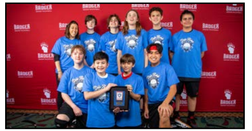
BOYS 13/14 WHITE 1ST PLACE