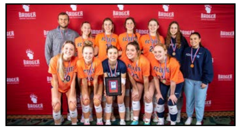
G17 OPEN 1ST PLACE: