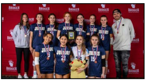
G13 OPEN 3RD PLACE: