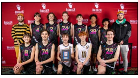
BOYS 15 RED 1ST PLACE: