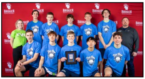
BOYS 16 WHITE 1ST PLACE: