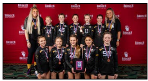
G11 BADGER 3RD PLACE: