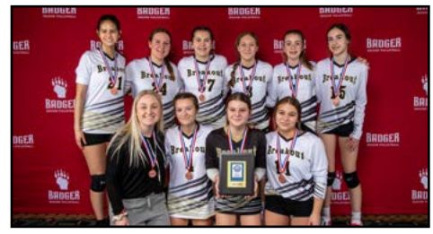
G14 BADGER 3RD PLACE: