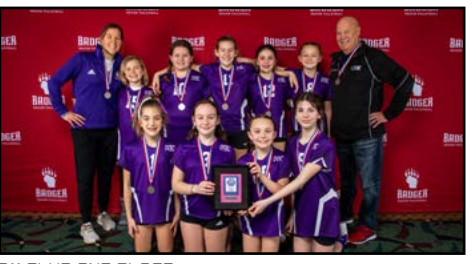
G11 CLUB 2ND PLACE: