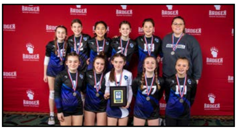
G13 CLUB 2ND PLACE: