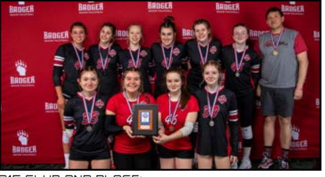
G15 CLUB 2ND PLACE: