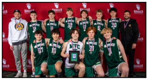
BOYS 165 2ND PLACE: