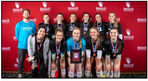
G18 OPEN 3RD PLACE: