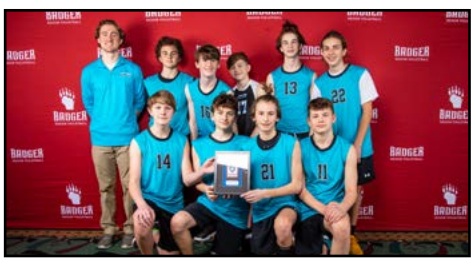
BOYS 13/14 WHITE 2ND PLACE