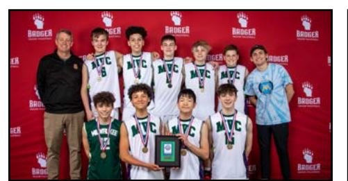
BOYS 14S 1ST PLACE: