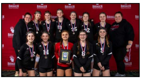
G14 WISCONSIN 2ND PLACE: