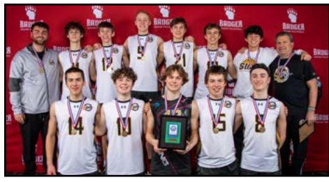
BOYS 16S 1ST PLACE: