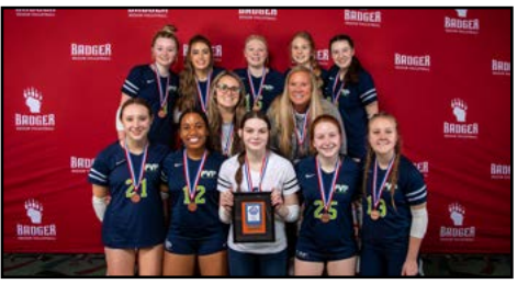
G15 CLUB 3RD PLACE: