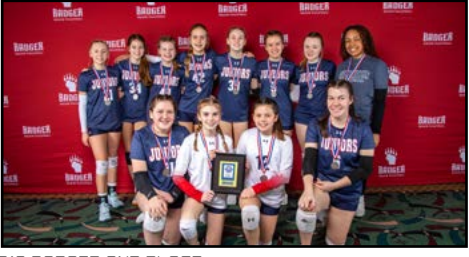
G13 BADGER 2ND PLACE: