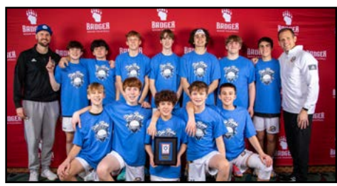
BOYS 15 RED 1ST PLACE: