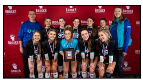
G15 OPEN 3RD PLACE: