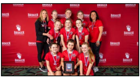
G12 OPEN 3RD PLACE: