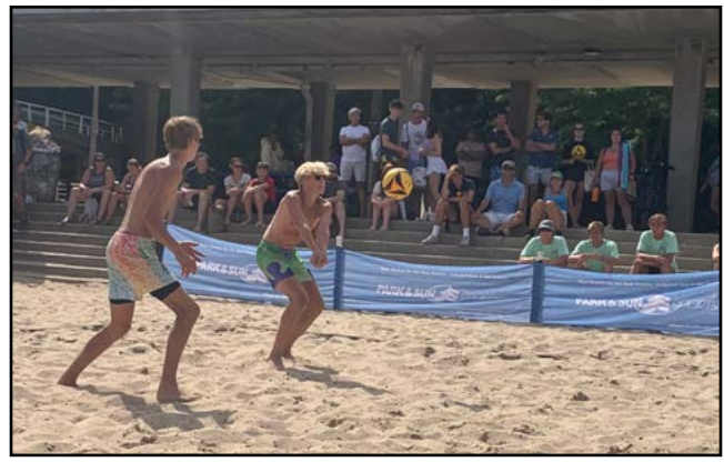
Thank you to all the athletes, coaches, officials and spectators who came out to Bradford Beach July 29-30 for a beautiful weekend for the Badger Region Beach Championships. We look forward to seeing you back next year.