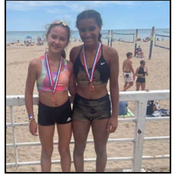
3rd place: Sand Blasters