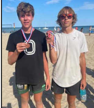
3rd place: Dawgs Out (B14s)