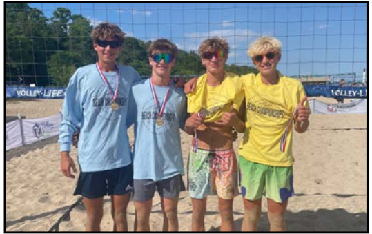
1st place: Ball Busters (blue); 2nd place: Swamp Puppies