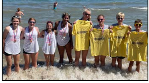
2nd place: Beach Demons; 3rd place: Hits & Giggles