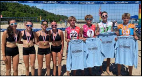
1st place (tie): The Stingers & Cedartown Slammers