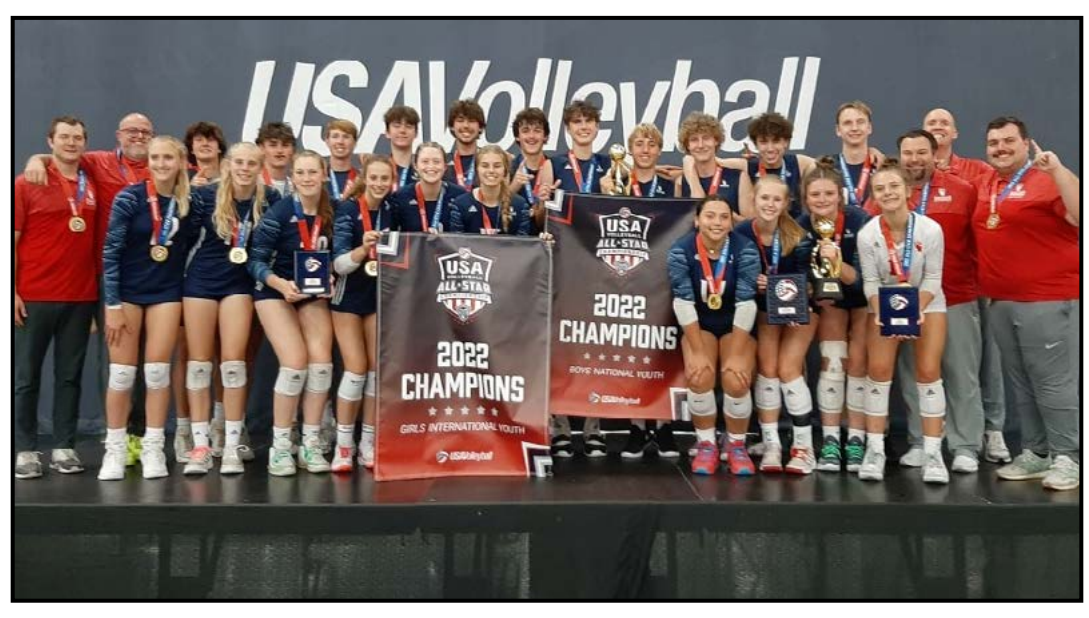
The Badger Region brought home two gold medals from the All-Star event in Tulsa in 2022. The event will be in Madison in 2025.

Not only will players, coaches and spectators travel from around the nation to Madison, but officials will as well. Each participating region sends experienced and up-and-coming officials to work the event and be mentored by world-class officials to gain experience officiating high-level volleyball and making important connections to further