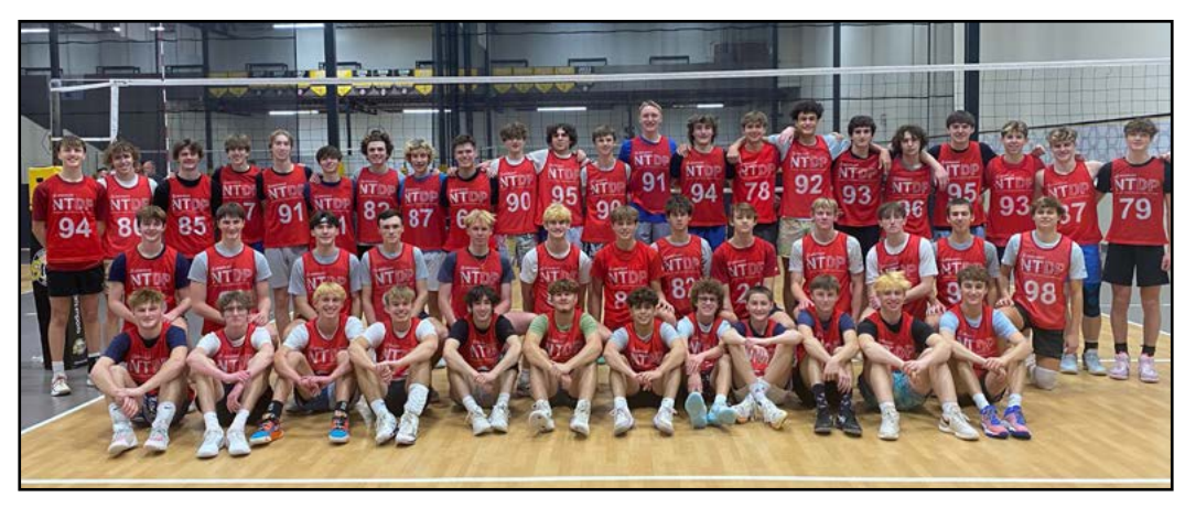
Forty-nine boys took part in the National Team Development Program Accelerator on Nov. 19 in Menomonee Falls