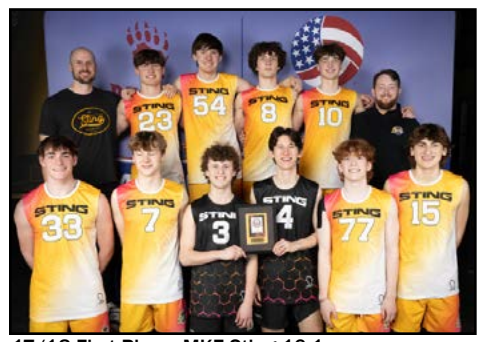
17/18 First Place: MKE Sting 16-1