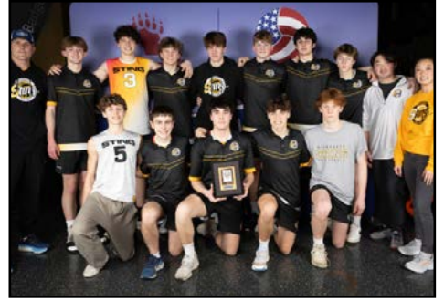
16/17 Second Place: MKE Sting 17-2