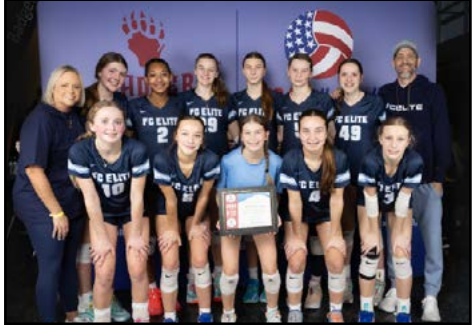
American Bid: FC Elite 14-Navy