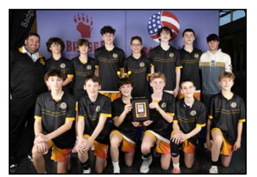
13/14 First Place: MN Select 14-Regional Black