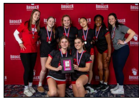
16 Badger 2nd Place: I AM 16-Gold