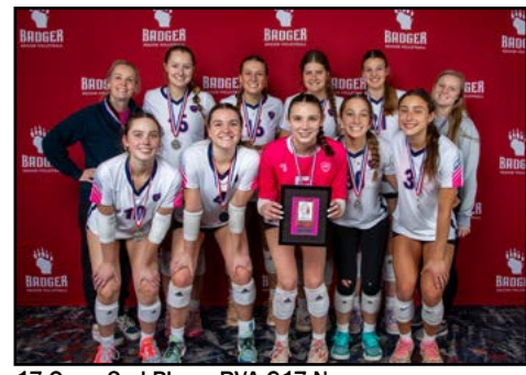
17 Open 2nd Place: RVA G17-Navy