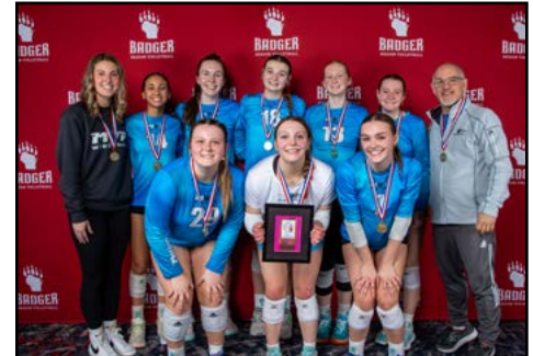
17 Club 1st Place: MVP 17-Silver