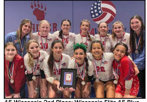
15 Wisconsin 2nd Place: Wisconsin Elite 15-Blue