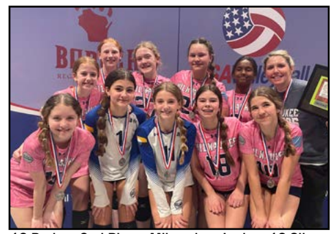
13 Badger 2nd Place: Milwaukee Juniors 13-Silver