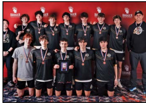
17 Boys 3rd Place: MKE Sting 17-2