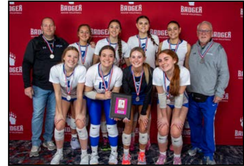
17 Badger 2nd Place: River City 17-Black