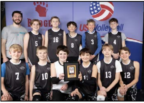
12/13s Third Place: Madison Elite 13s