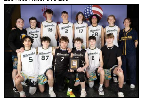
16/17s First Place: MVC 17-Sydney