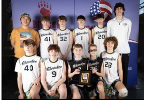
14s Second Place: MVC 14-Tim