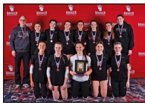
14 Badger 3rd Place: Spiketown Triton Juniors 14s