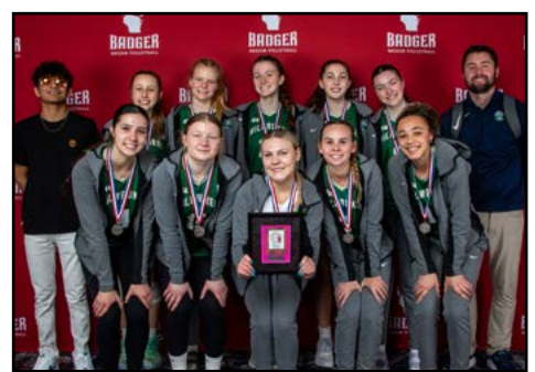
16 Open 2nd Place: 414 16-Elite