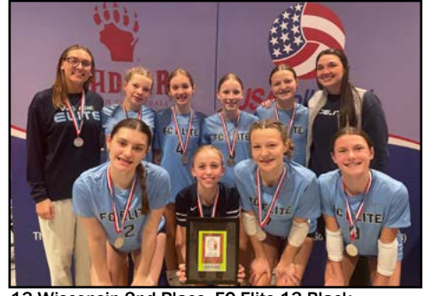
13 Wisconsin 2nd Place: FC Elite 13-Black