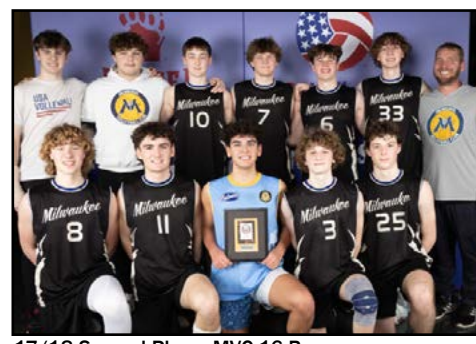
17/18 Second Place: MVC 16-Bro