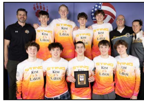
18s Third Place: MKE Sting 17-1