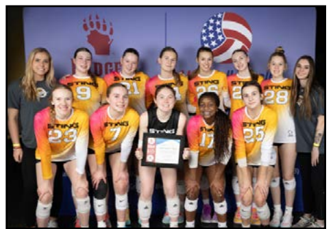
American Bid: MKE Sting 15-Black