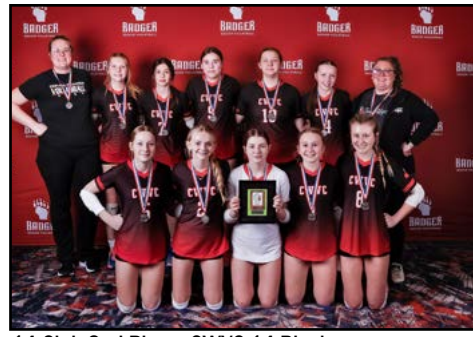
14 Club 2nd Place: CWVC 14-Black