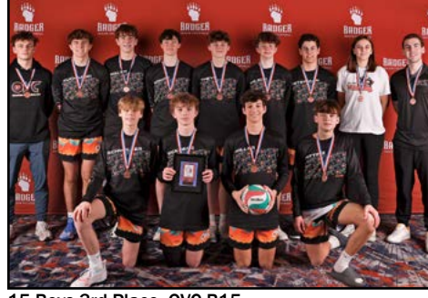
15 Boys 3rd Place: OVC B15