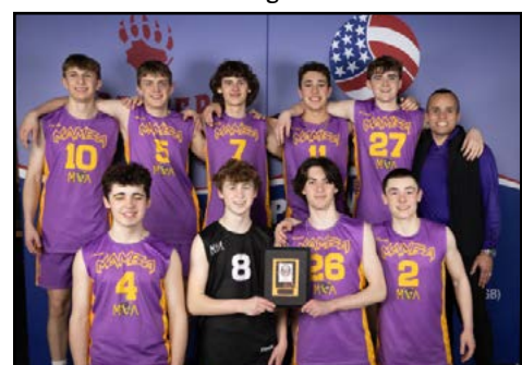
16/17 Third Place: Mamba 17-Black