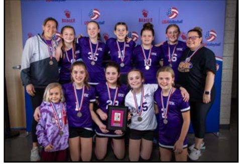
12 Open 2nd Place: Oconomowoc 12-Purple