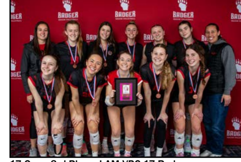
17 Open 3rd Place: I AM VBC 17-Red