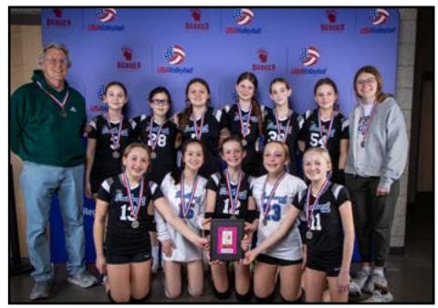
12 Badger 2nd Place: Southwest 12-Blue