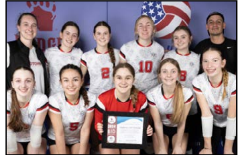
Freedom Bid: Madtown 161 National