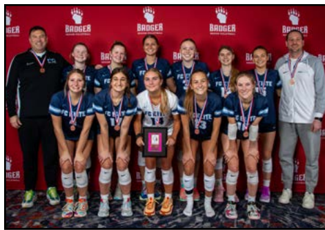
18 Open 3rd Place: FC Elite 18-White