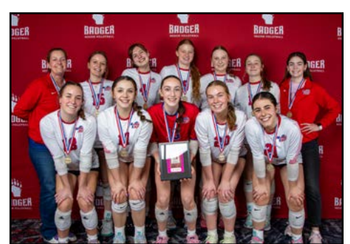
16 USA 1st Place: Wisconsin Elite 16-Red