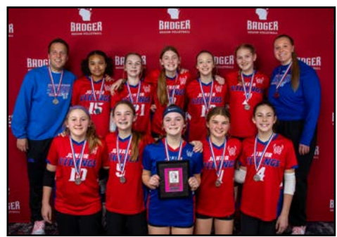
13 Club 2nd Place: Junior Vikings 13-Blue