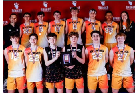
16 Boys 3rd Place: MKE Sting 16-3