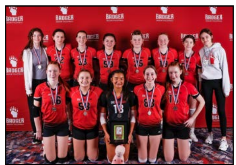
14 Wisconsin 2nd Place: 1W Bay 14 Onyx