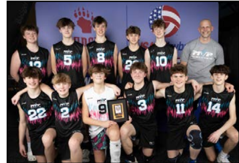
15s Third Place: MVP 15-Blue