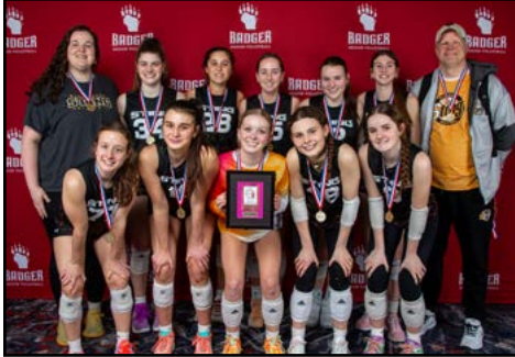
17 Open 1st Place: MKE Sting 17-Black