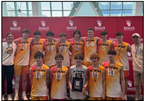
16 Boys 2nd Place: MKE Sting 16-2