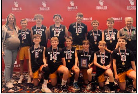
12 Boys 1st Place: MKE Sting 12-1