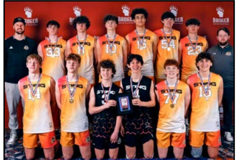
16 Boys 1st Place: MKE Sting 16-1