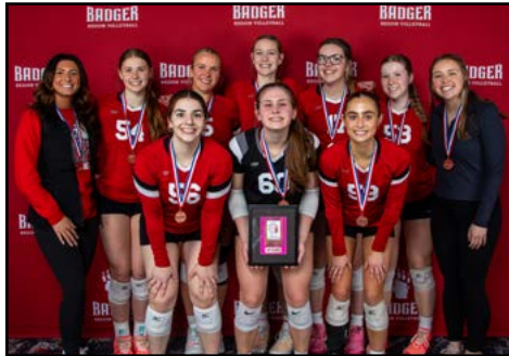
18 Badger 3rd Place: Crossfire VBC G18-Blaze