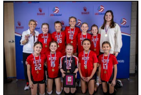
11 Badger 1st Place: Heat 11-Red