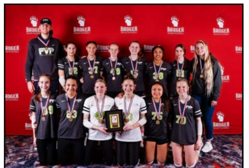
14 Wisconsin 1st Place: FVP 14-Regional