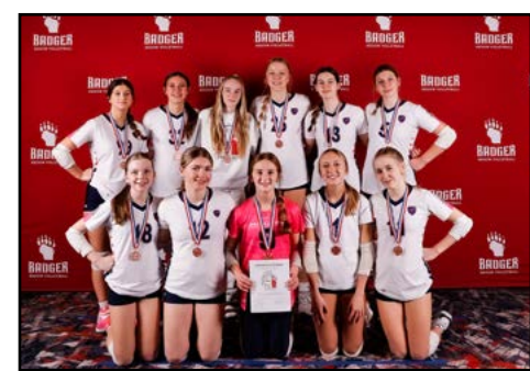
14 Wisconsin 3rd Place: RVA 14-White