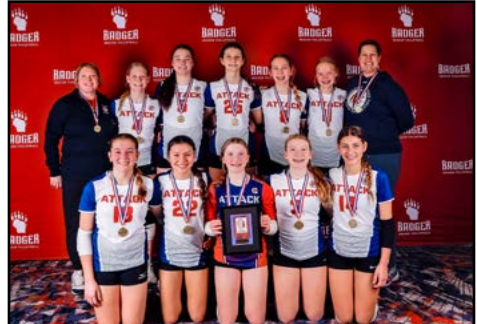
14 USA 1st Place: Wisconsin Attack 14-Blue