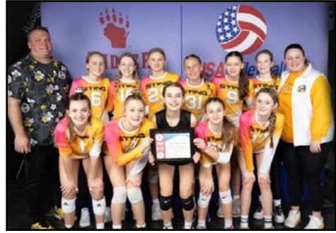
American Bid: MKE Sting 13-White