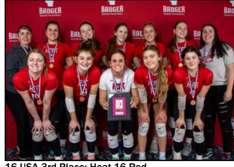
16 USA 3rd Place: Heat 16-Red