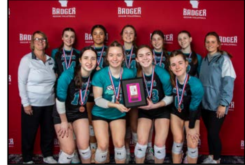
16 Club 3rd Place: Wisconsin Premier 16-Teal