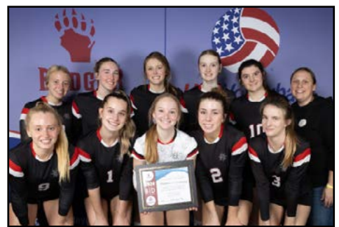
American Bid: Madtown 171 National