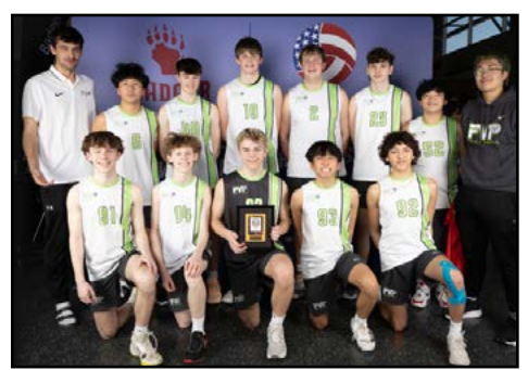
15/16s First Place: FVP 16-Regional