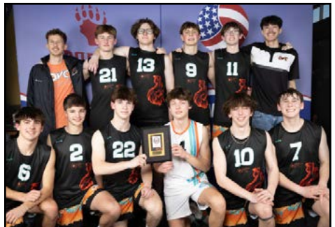
16s First Place: OVC 16s