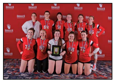
14 Badger 1st Place: Madtown 141 Regional