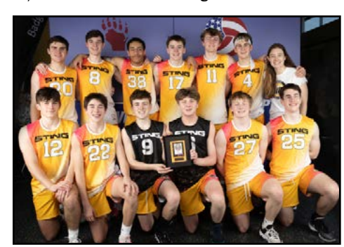
16s Third Place: MKE Sting 16-3