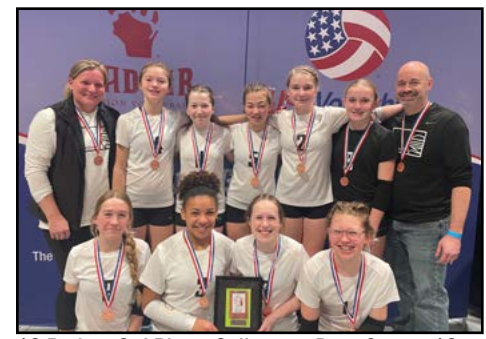
13 Badger 3rd Place: Spiketown Door County 13s