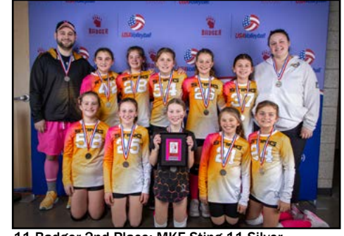
11 Badger 2nd Place: MKE Sting 11-Silver