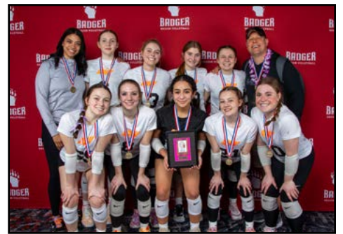
17 Badger 1st Place: Adversity-WI 17-1