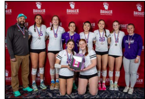
18 Club 2nd Place: FDL Fusion 18-Purple