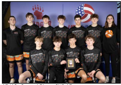
15/16s Second Place: OVC 15s