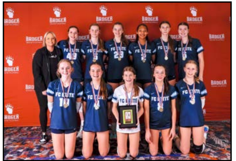
14 Open 1st Place: FC Elite 14-Navy