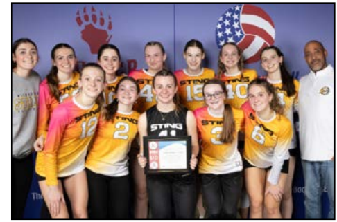
National Bid: MKE Sting 15-Gold