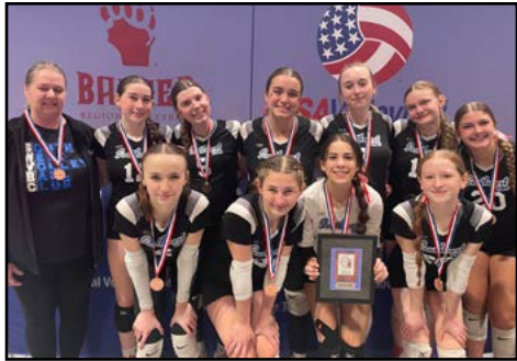
15 Badger 3rd Place: Southwest G15-White