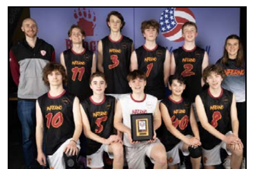
15s First Place: Madison Inferno 151