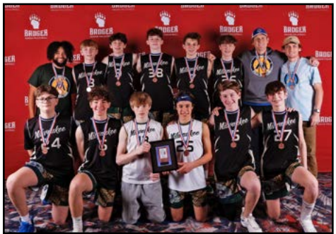
14 Boys 3rd Place: MVC 14-Dixon