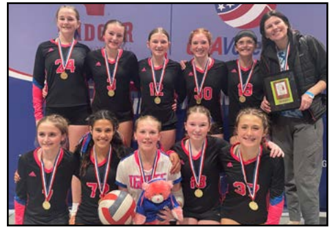
13 Badger 1st Place: Madison Ignite 13-2