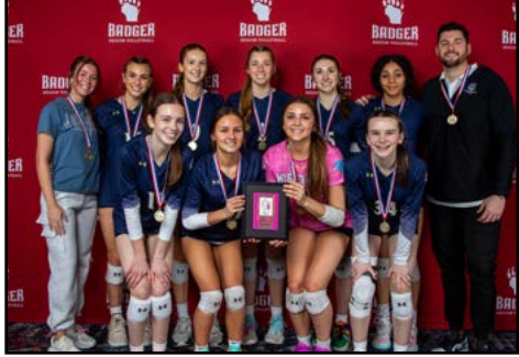
16 Open 1st Place: Wisconsin Juniors 16-1