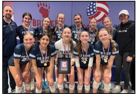
15 Open 1st Place: FC Elite 15-Navy