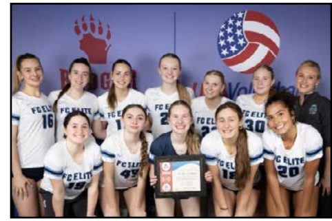
American Bid: FC Elite 17-White