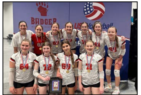
15 Badger 1st Place: Madtown 151-Regional