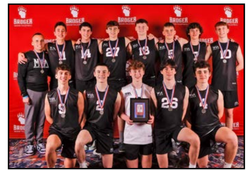
17 Boys 2nd Place: Mamba 17-Black