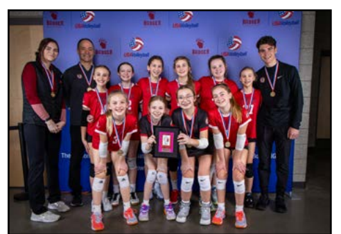
12 Open 1st Place: I AM 12-Red