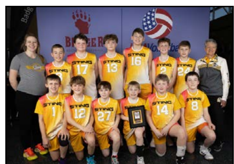
12/13s Second Place: MKE Sting 12-1