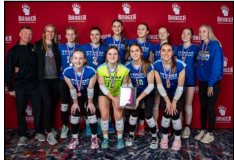
17 Club 3rd Place: Lakeshore Storm 17-Blue