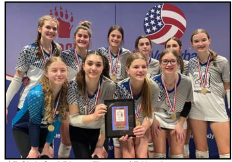
15 Club 2nd Place: Elevate 15-Hurricanes