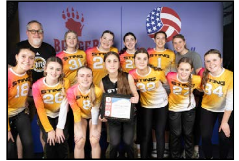
American Bid: MKE Sting 14-Black