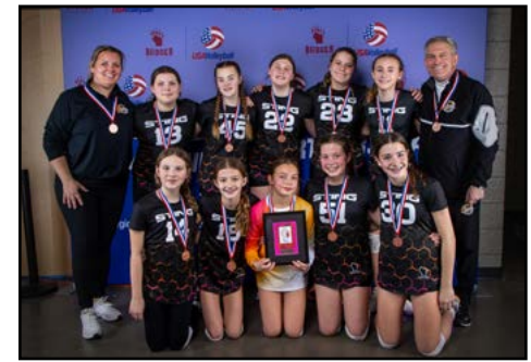
12 Open 3rd Place: MKE Sting 12-White