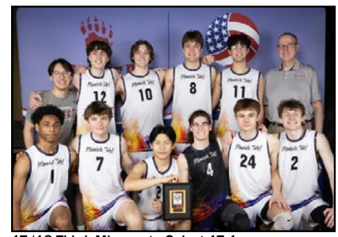
17/18 Third: Minnesota Select 17-1