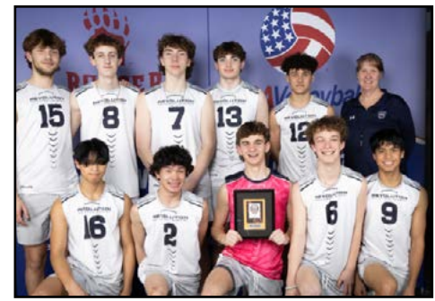
16s Second Place: RVA 16-Navy