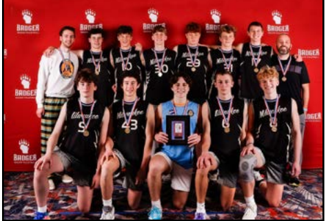
17 Boys 1st Place: MVC 17-Mike