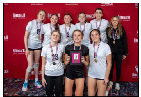
16 Badger 1st Place: Spiketown Reign 16s