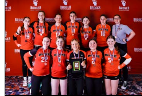
14 Club 3rd Place: Wisconsin Blaze 14-Red