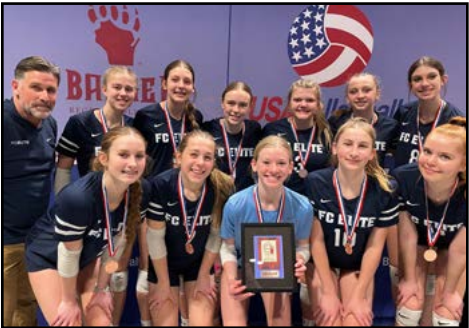
15 USA 3rd Place: FC Elite 15-Black