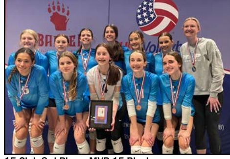
15 Club 3rd Place: MVP 15-Black