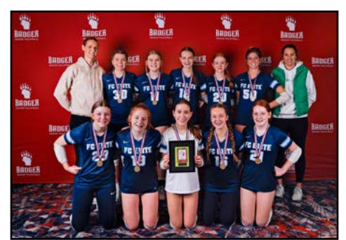
14 Club 1st Place: FC Elite 14-Blue