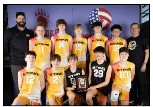
14s First Place: MKE Sting 14-1