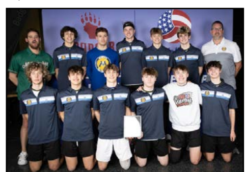
18s Second Place: MVC 18-Erik