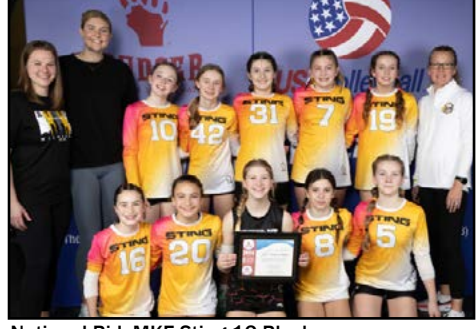
National Bid: MKE Sting 12-Black