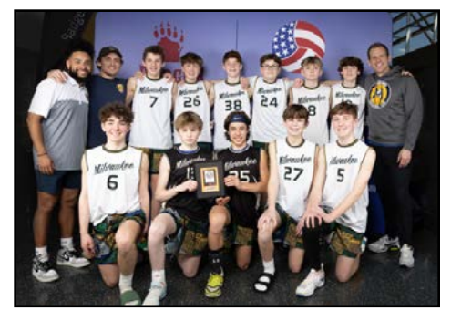
14s Third Place: MVC 14-Dixon