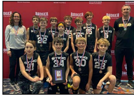
12 Boys 2nd Place: MKE Sting 12-2