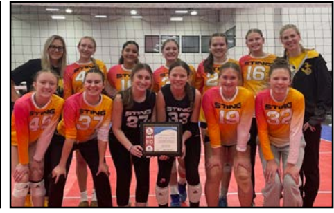
American Bid: MKE Sting 16-White