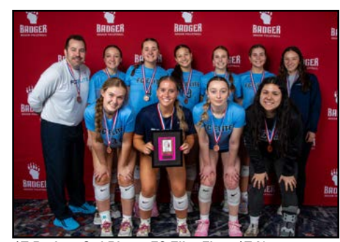
17 Badger 3rd Place: FC Elite Flyer 17-Navy