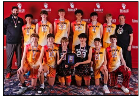
14 Boys 1st Place: MKE Sting 14-1