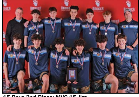
15 Boys 2nd Place: MVC 15-Jim