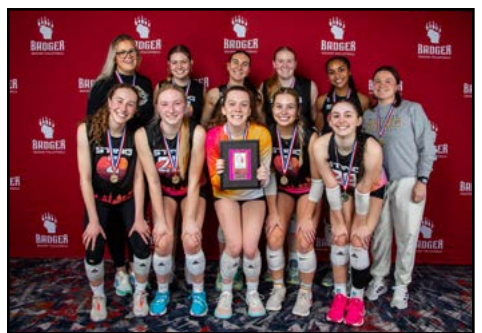
18 Open 1st Place: MKE Sting 18-Black