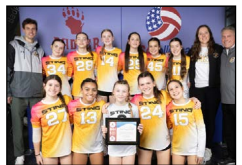
National Bid: MKE Sting 13-Gold