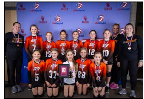
11 Badger 3rd Place: Adversity 11-1