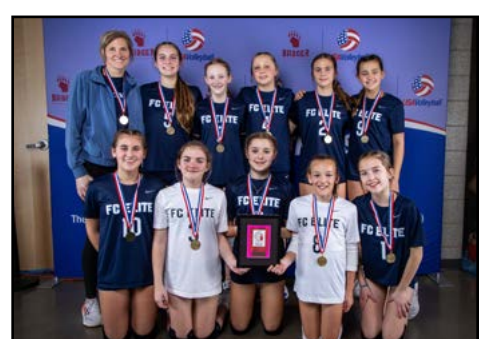
12 Badger 1st Place: FC Elite 12-Red