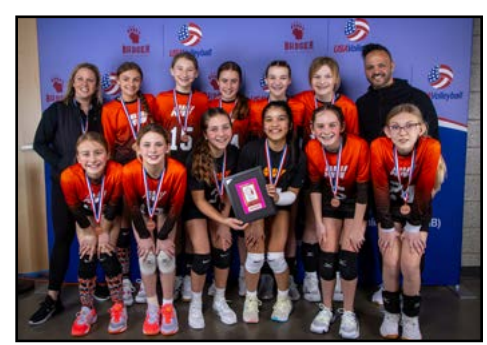
12 Club 3rd Place: Adversity 12-1