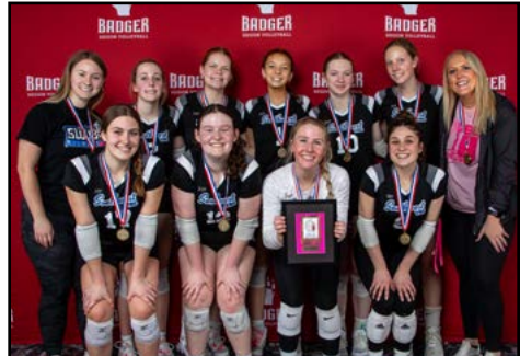
16 Wisconsin 1st Place: Southwest G16-White