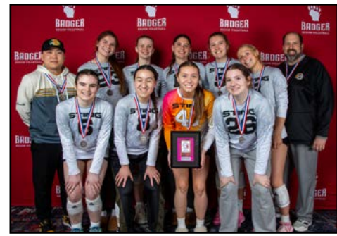
18 Open 2nd Place: MKE Sting 18-White