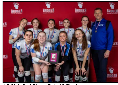
16 Club 2nd Place: Epic 16-Black