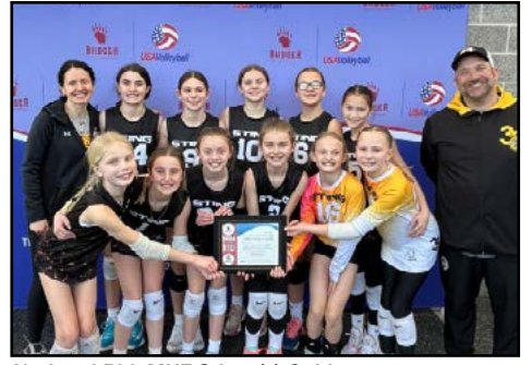
National Bid: MKE Sting 11-Gold

2024 BID WINNERS AT THE BADGER REGION QUALIFIER