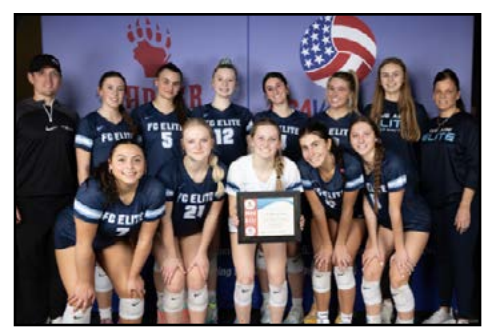
National Bid: FC Elite 17-Navy