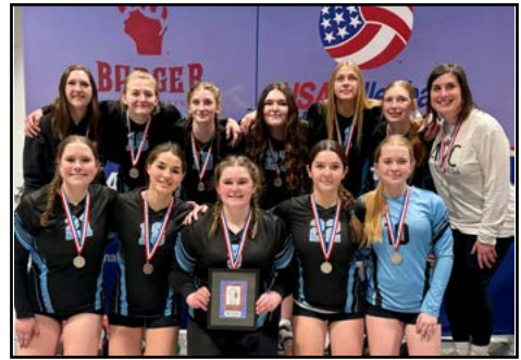
15 Badger 2nd Place: AVC 15s