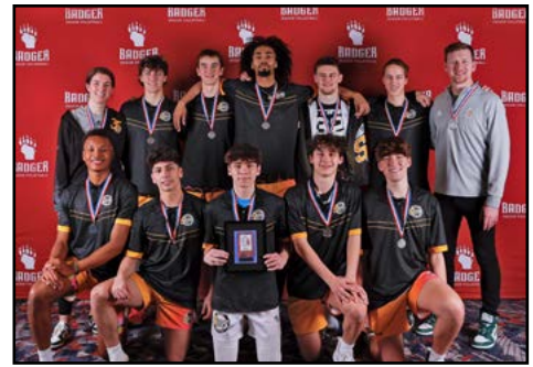
18 Boys 2nd Place: MKE Sting 18-1