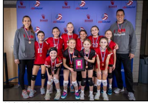
11 Club 3rd Place: I AM 11-Red