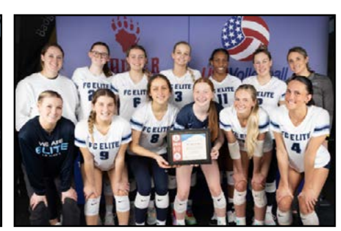
American Bid: FC Elite 18-Nav