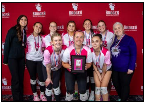
18 Badger 2nd Place: Valley Velocity 18-Lime