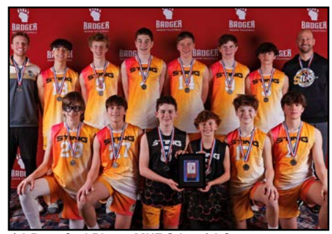
14 Boys 2nd Place: MKE Sting 14-2