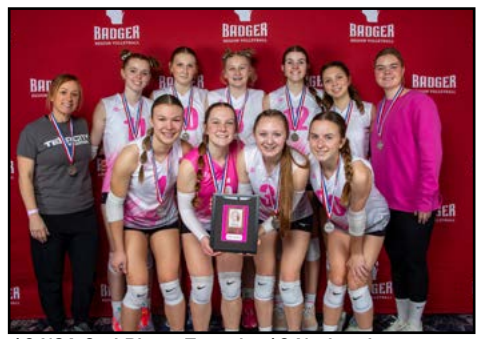
16 USA 2nd Place: Tenacity 16-National