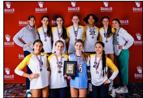
14 Open 2nd Place: Wisconsin Juniors 14-1