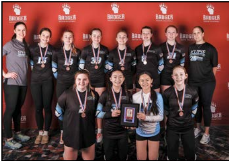
14 USA 3rd Place: Eclipse 14-Solar