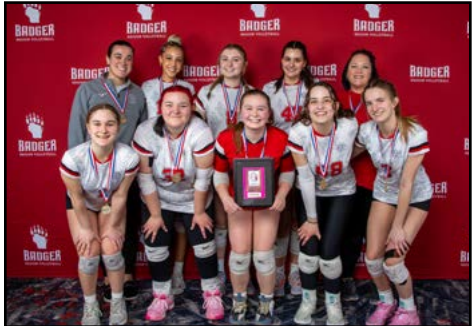
18 Badger 1st Place: Madtown 181-Select