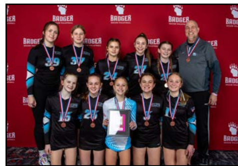
13 Club 3rd Place: Eclipse 13-Solar