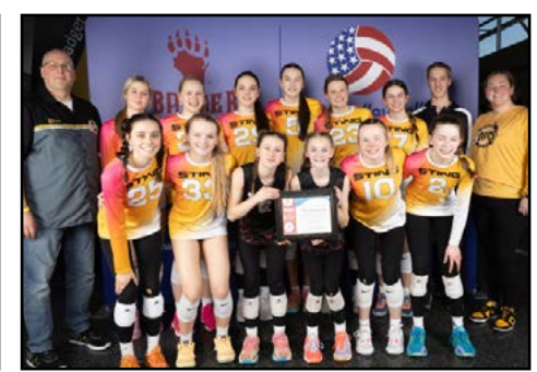
National Bid: MKE Sting 14-Gold