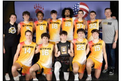
18s First Place: MKE Sting 18-1