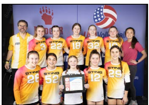
National Bid: MKE Sting 13-Black