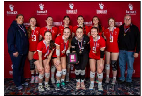
18 Club 1st Place: Northside VBC 18-1