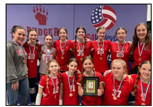
13 Wisconsin 3rd Place: I AM 13-White