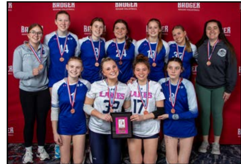
16 Wisconsin 3rd Place: Lakes Juniors 16-Select