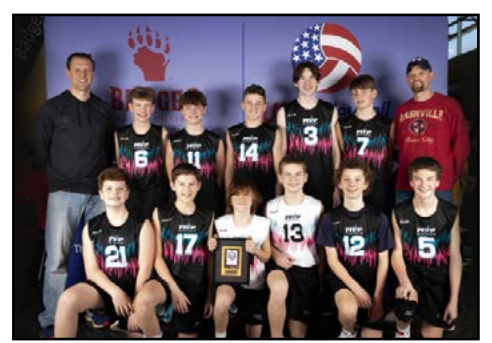
12/13s First Place: MVP 13 Blue