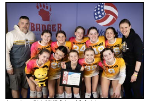
American Bid: MKE Sting 12-Gold