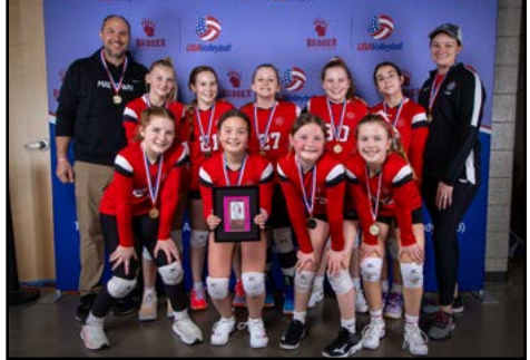
12 Club 1st Place: Madtown 122-Select