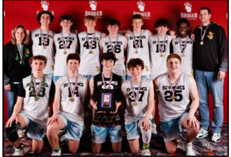
15 Boys 1st Place: MKE Sting 15-1