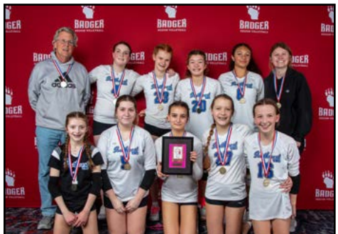
13 Club 1st Place: Southwest G13-Blue