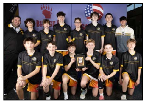
13/14 Third Place: MKE Sting 13-1