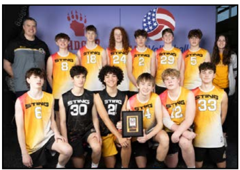
15/16s Third Place: MKE Sting 15-2