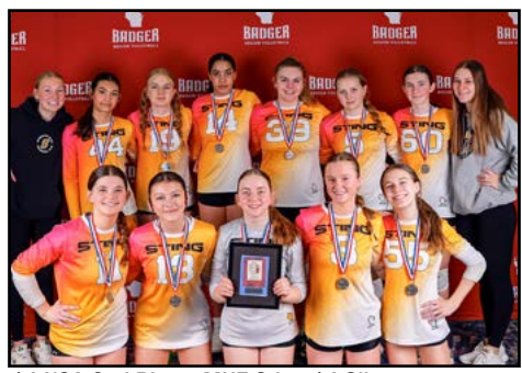
14 USA 2nd Place: MKE Sting 14-Silver