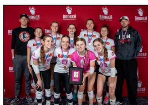
16 Open 3rd Place: I AM 16-Red