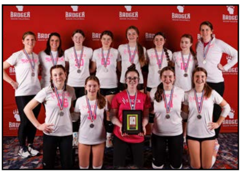
14 Badger 2nd Place: Wisconsin Shock 14-White