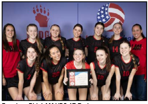
Freedom Bid: I AM VBC 17-Red