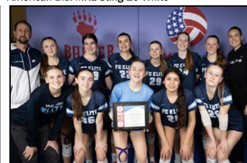
American Bid: FC Elite 15 Navy