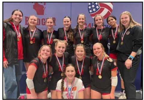
15 Wisconsin 1st Place: I Am 15-White