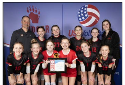
American Bid: I AM VBC 12-Red