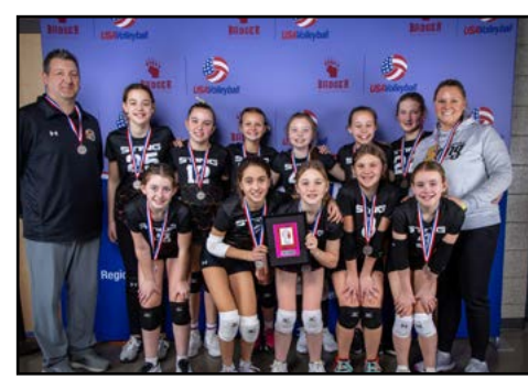
11 Club 2nd Place: MKE Sting 11-Black