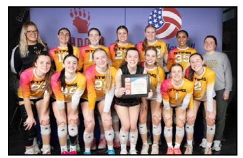
National Bid: MKE Sting 18-Black