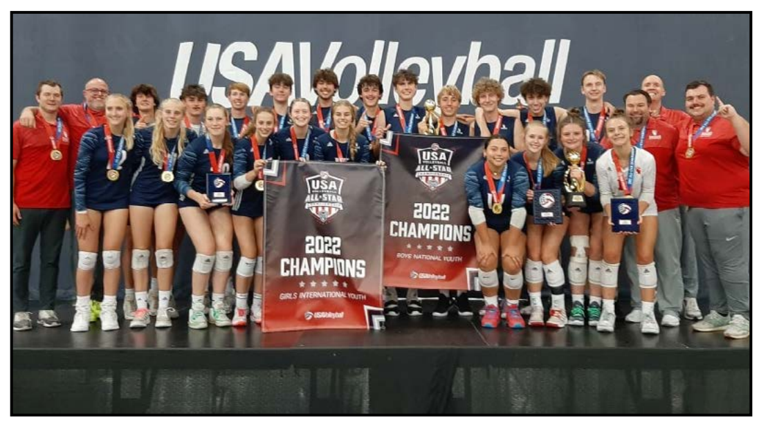
The Badger Region brought home two gold medals from the All-Star event in Tulsa in 2022. The event will be in Madison in 2025.

Not only will players, coaches and spectators travel from around the nation to Madison, but officials will as well. Each participating region sends experienced and up-and-coming officials to work the event and be mentored by world-class officials to gain experience officiating high-level volleyball and making important connections to further