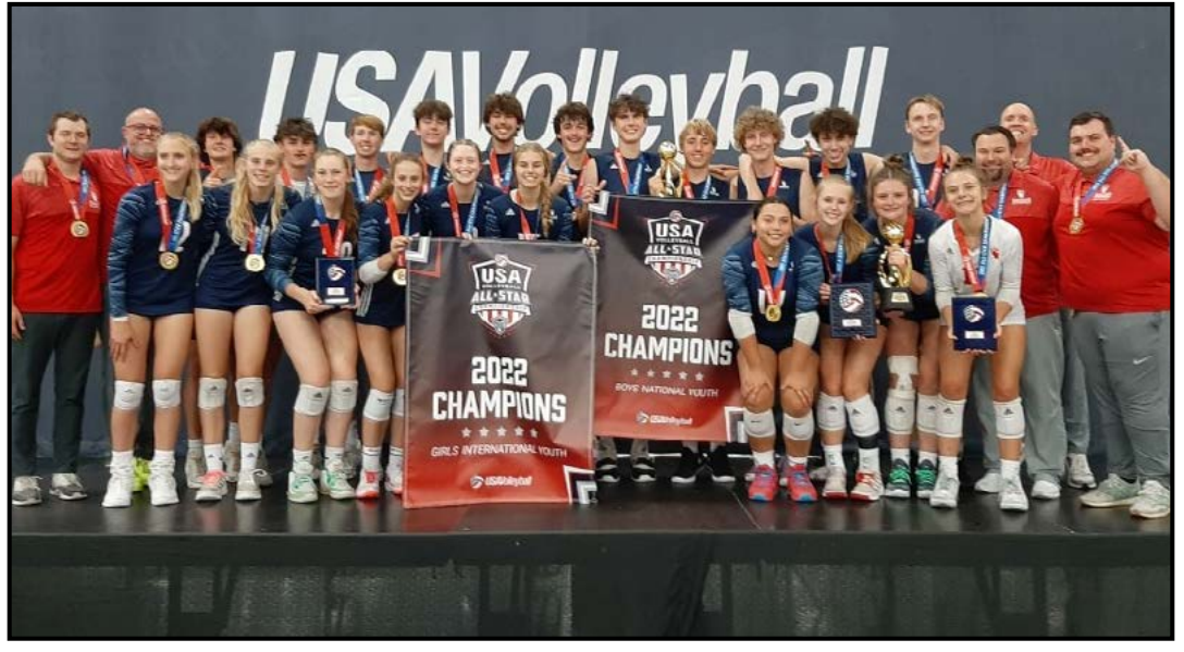
The Badger Region brought home two gold medals from the All-Star event in Tulsa in 2022. The event will be in Madison in 2025.

Not only will players, coaches and spectators travel from around the nation to Madison, but officials will as well. Each participating region sends experienced and up-and-coming officials to work the event and be mentored by world-class officials to gain experience officiating high-level volleyball and making important connections to further