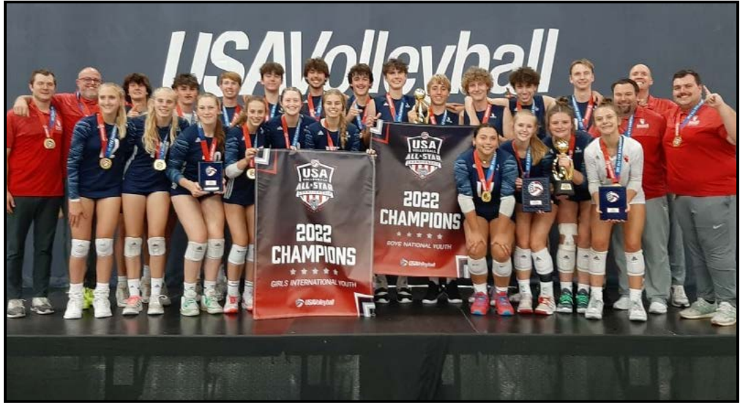
The Badger Region brought home two gold medals from the All-Star event in Tulsa in 2022. The event will be in Madison in 2025.

Not only will players, coaches and spectators travel from around the nation to Madison, but officials will as well. Each participating region sends experienced and up-and-coming officials to work the event and be mentored by world-class officials to gain experience officiating high-level volleyball and making important connections to further