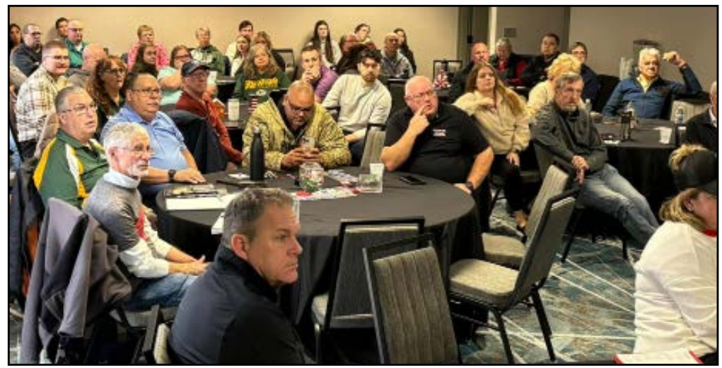
A combination of new and experience officials came to the Brookfield Sheraton Sunday for our first in-person ref meeting of the year. Another meeting is set for Dec. 8. And an online meeting is set for Dec. 10.

WWW.BADGERVOLLEYBALL.ORG | MEMBERSHIP@BADGERVOLLEYBALL.ORG